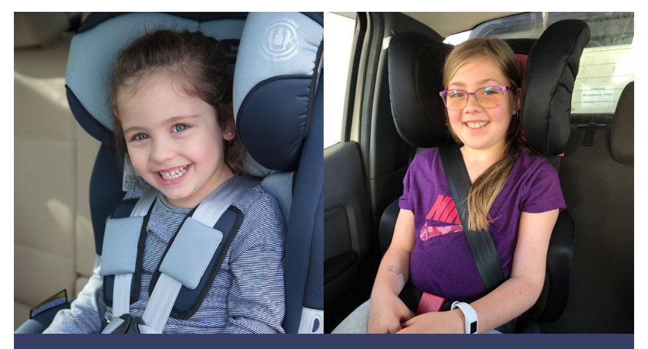
Child Car Restraint with Inbuilt Harness

Child car restraint models are now available with inbuilt harnesses to accommodate children up to approximately 8 years and booster seats that accommodate children up to approximately 10 years. When deciding whether your child is ready to sit on the vehicle seat do the "five step test ". See the "Child Restraint Guidelines" publication on the Kidsafe Australia website.