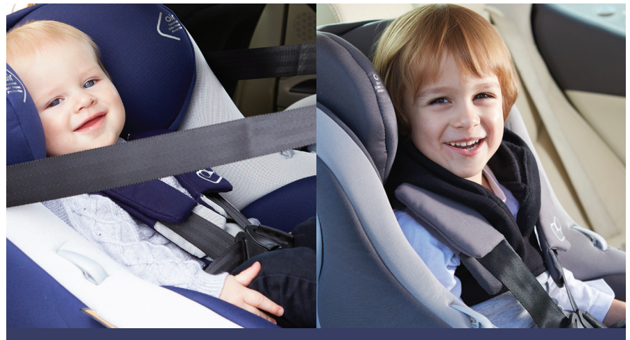
Rearward Facing Child Car Restraint

Keep your child in a child car restraint with an inbuilt harness until the child reaches the maximum size limit (height/weight) of the restraint. Extended rearward facing options are available on some convertible child car restraints which have the ability to take a child rearward facing up to 2-3 years (30 months) of age.