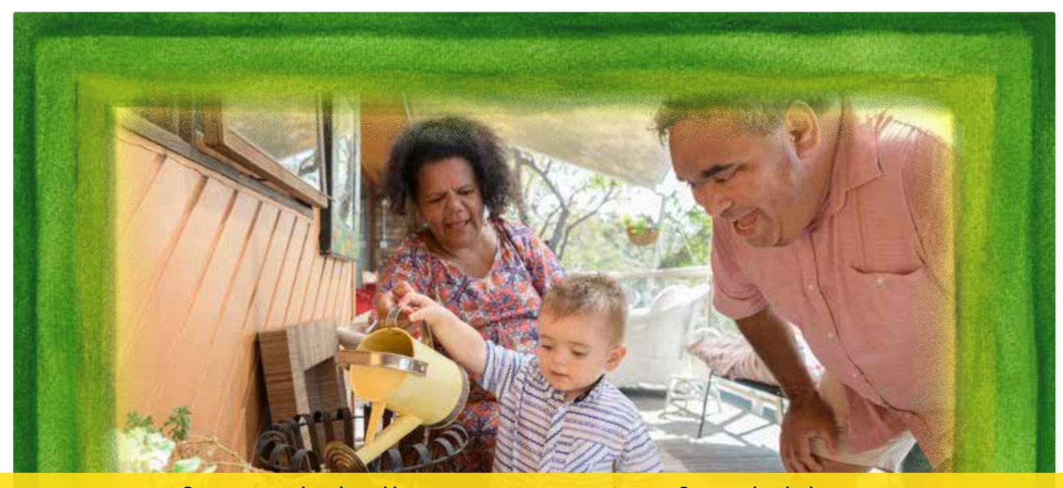
Benefits and challenges in caring for children related to you

As with most things in life, taking on the care of children related to you will bring benefits and rewards as well as some challenges. The experiences of others can be useful in having some sense of what you, your household and wider family might encounter.