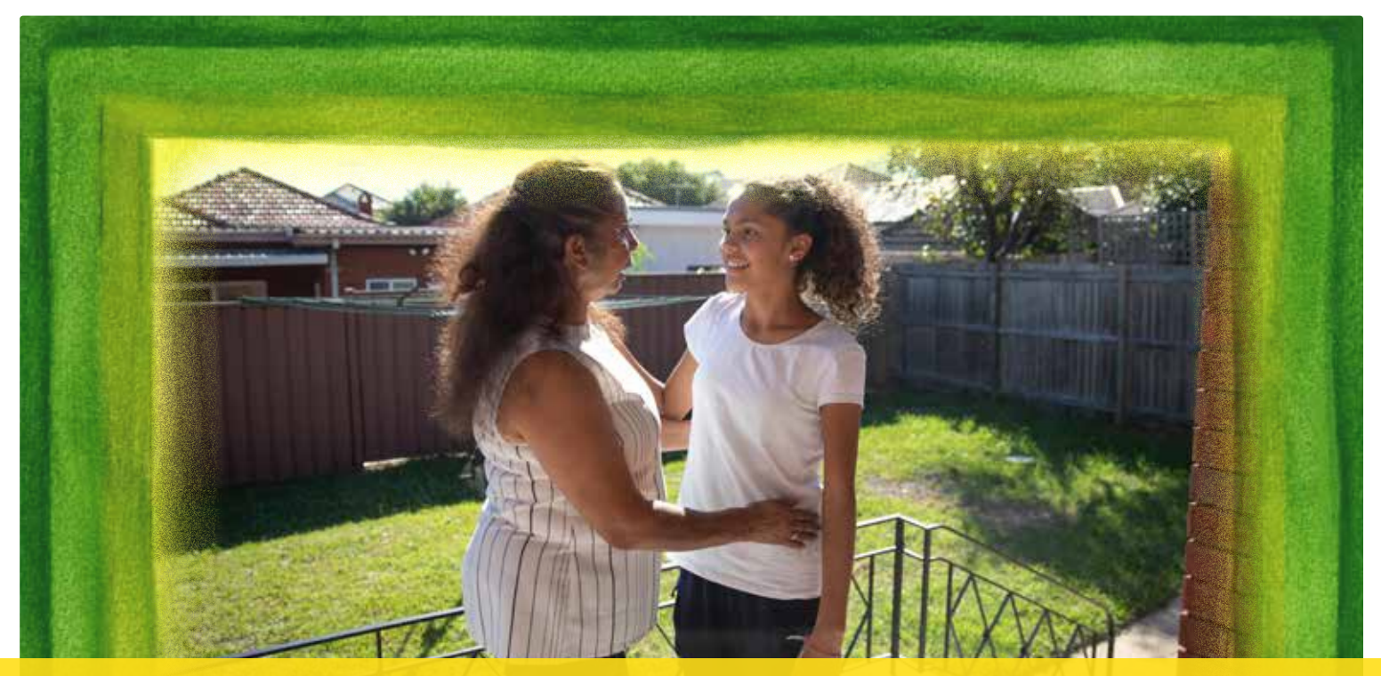
Children and their experience

Even though you're family and you may know the children very well, there's likely to be much you don't know about what's happened for them and the effect of this, now and in the future.